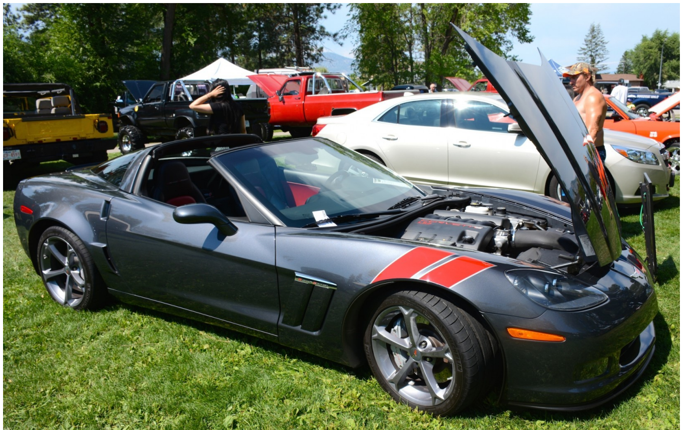
MEMBER SPOTLIGHT..... Top Pic: Darcy Detlor's 1965 Convertible Bottom Pic: Charlie Cohoe's Grand Sport