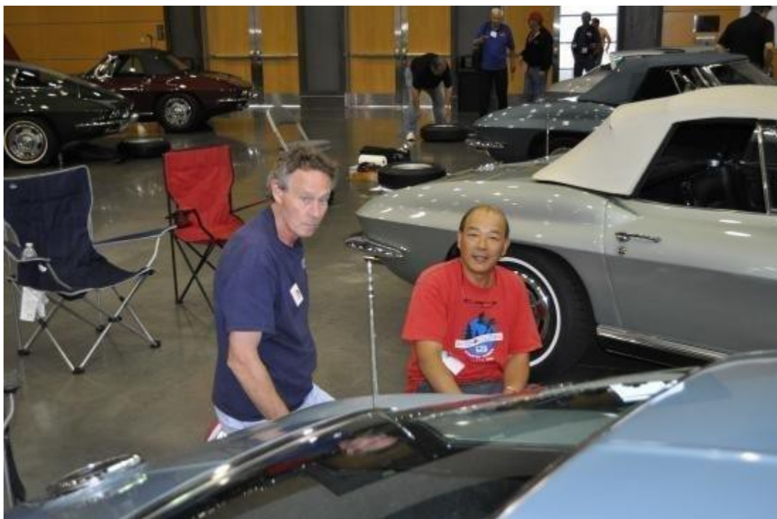
BELOW PIC: The BC Chapter Group did well!