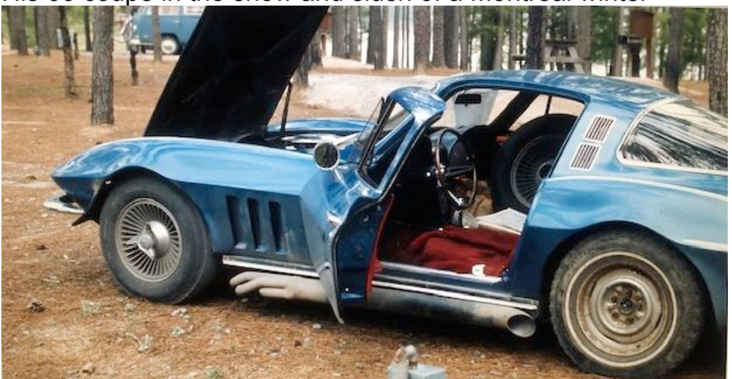
Wayne's blue 65 with KO wheel in the passenger seat