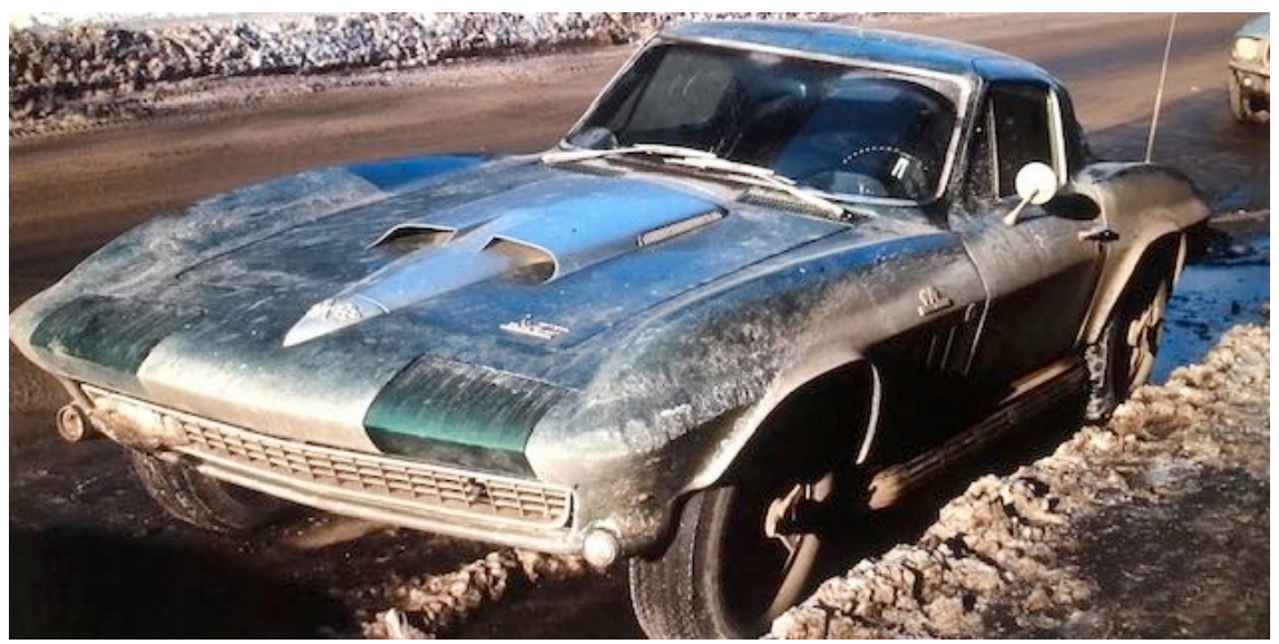
His 66 coupe in the snow and slush of a Montreal winter