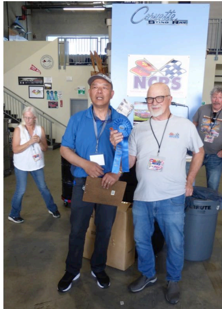
Top Flight Al's 1998