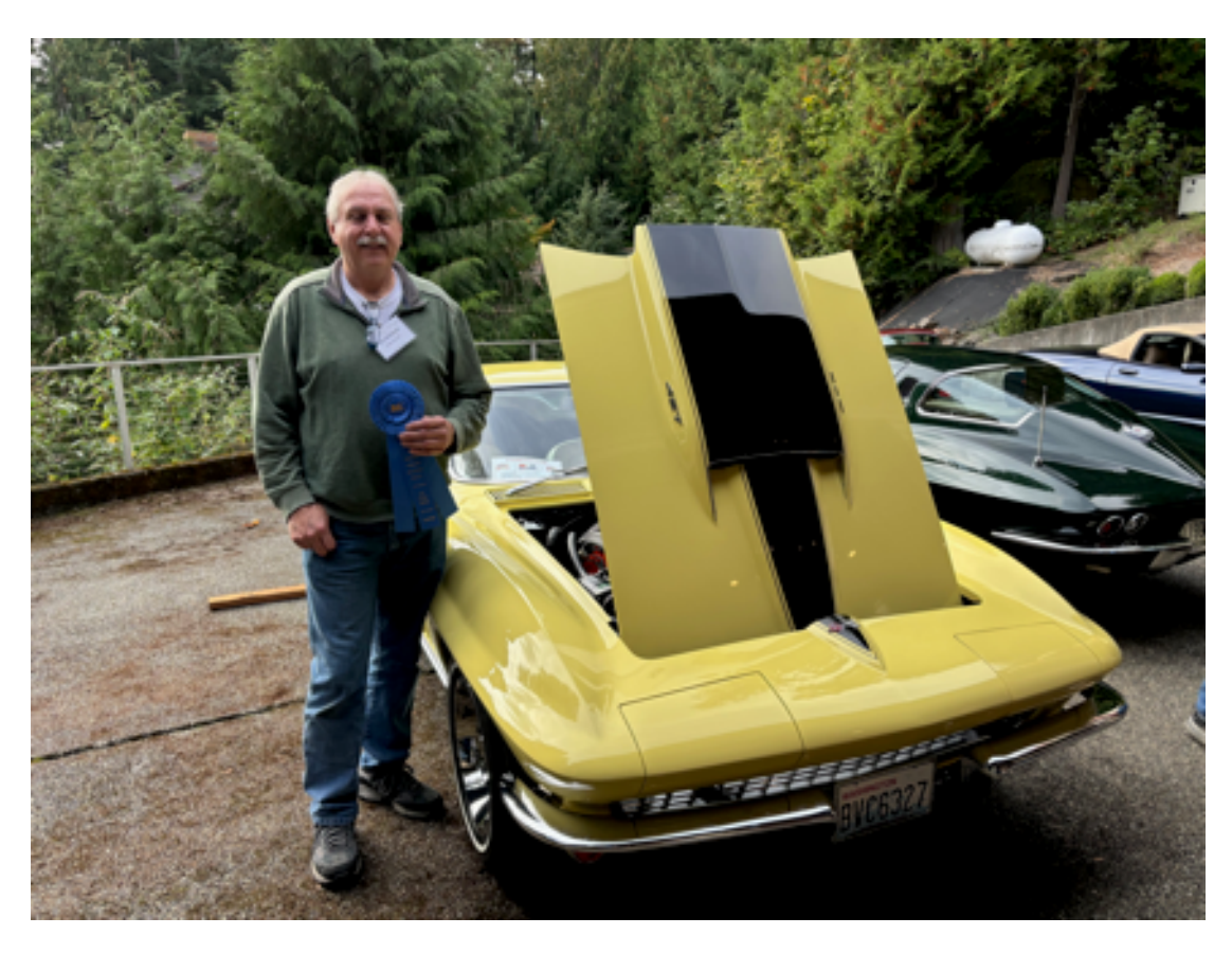
Below are Grant's photos from the NW Chapter judging meet at Renton. A 1967 big block coupe and a 1968 L-88!